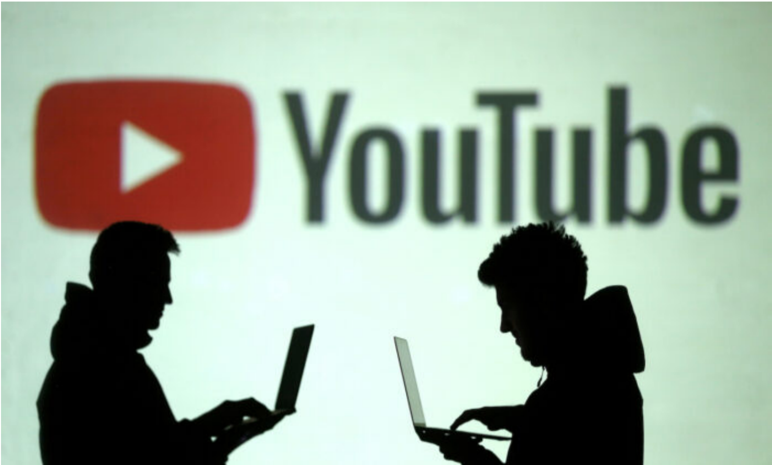
Silhouettes of mobile device users are seen next to a screen projection of YouTube's logo in this picture illustration taken March 28, 2018.